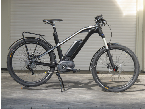
Figure 2: Example of a Pedelec, the most Popular Electric Two-wheeled Vehicle in Germany.

riding on one-way streets against the direction of travel. As a result, the pedelec has become increasingly interesting not only for private use but also as a sustainable technology for the commercial transport of goods and people. The rapidly growing range of pedelec cargo bikes and pedelec bicycle rickshaws as well as numerous pilot projects and public funding measures are complementing this trend.