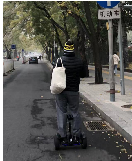
Figure 4: Example of Hoverboard in Use. Permitted Usage Varies between Chinese Provinces.

Following these unchecked individual decisions of provinces, the government gradually started implementing regulations on the national