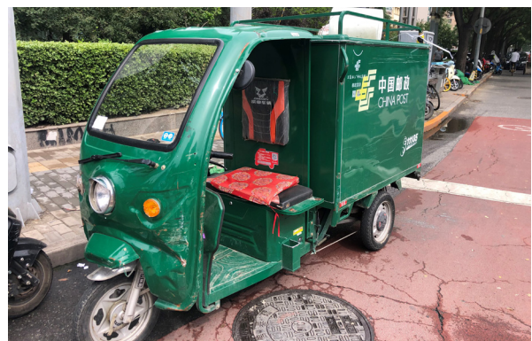
Figure 6: Example of a Chinese E-Tricycle for Logistics Purposes.

Nevertheless, there is huge potential for the commercial market with e-tricycles for the lo-