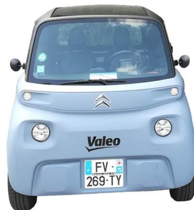
Figure 3: The Citroën Ami as an Example of a Four-wheeled LEV.

weight of up to 550 kg (without the mass of the batteries) and a maximum useful power of up to 15,000 W at a maximum speed of more than 45 km/h (FLEV). However, vehicles in class L7e are already considered four-wheeled motorised vehicles and must meet the technical requirements for three-wheeled motorised vehicles in class L5e. 19 On public roads, these vehicles are classified as standard passenger cars. The L7e vehicle class requires a class B driver's license, is subject to registration and requires a main technical inspection, usually every other year.