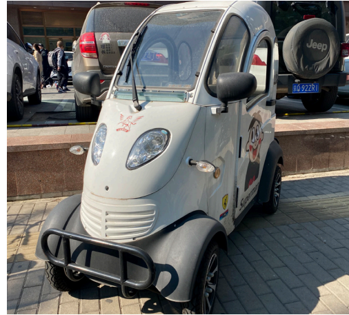
Figure 7: Example of a Four-wheeled LEV in China.

During the last decades, China already realised the complexity and risks associated with illegal electric four-wheeled vehicles, and consequently started tightening the regulations for various illegal vehicles since 2018. Even though there are still no national level management regulations yet, this increased monitoring shows a clear signal that controls and management are expected to be tighter than ever.