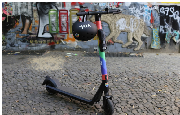
Figure 1: Example of an Electric Scooter as Regulated by the eKFV.

Hence, the German law prohibits the usage of e-boards, also referred to as hoverboards, on public roads. Meanwhile, selfbalancing boards