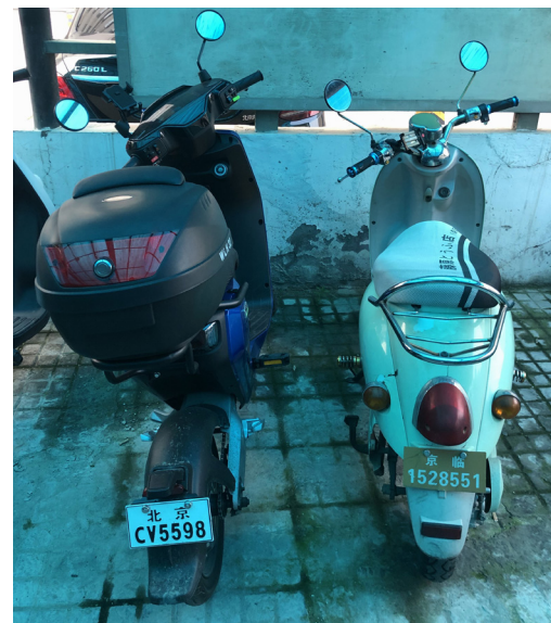
Figure 5: Examples of E-Bikes (White Licence Plate is Permanent, Orange License Plate is Temporary).

The Chinese e-moped can be compared to the German classification of s-pedelecs, which contrary to Germany, are very widespread in China. Chinese e-mopeds are seen as motorised vehicles with a speed limit of 50 km/h (in Germany 45 km/h) and – as the German pendant – require number plates, driving licenses (license F) and insurances. They are driven on public roads.